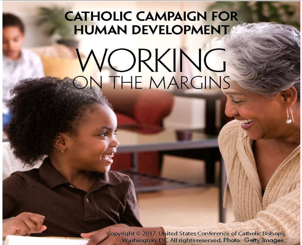
Copyright © 2017, United States Conference of Catholic Bishops, Washington, DC. All rights reserved.

CAMPAÑA CATÓLICA PARA EL DESARROLLO HUMANO TRABAJANDO DESDE LA PERIFERIA