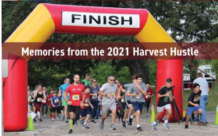
Memories from the 2021 Harvest Hustle