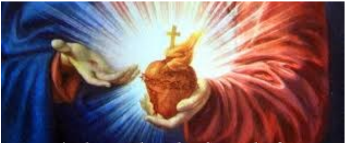
June is devoted to the Sacred of Jesus

During this month of your Most Sacred Heart I pray O Lord, That all who look upon your Sacred Image, may be drawn into profound union with you.